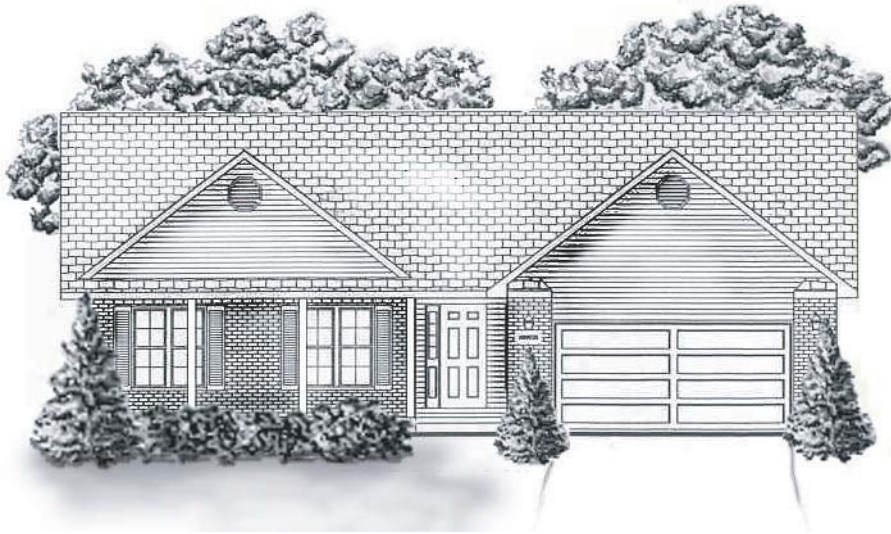
OPTIONAL ELEVATION A